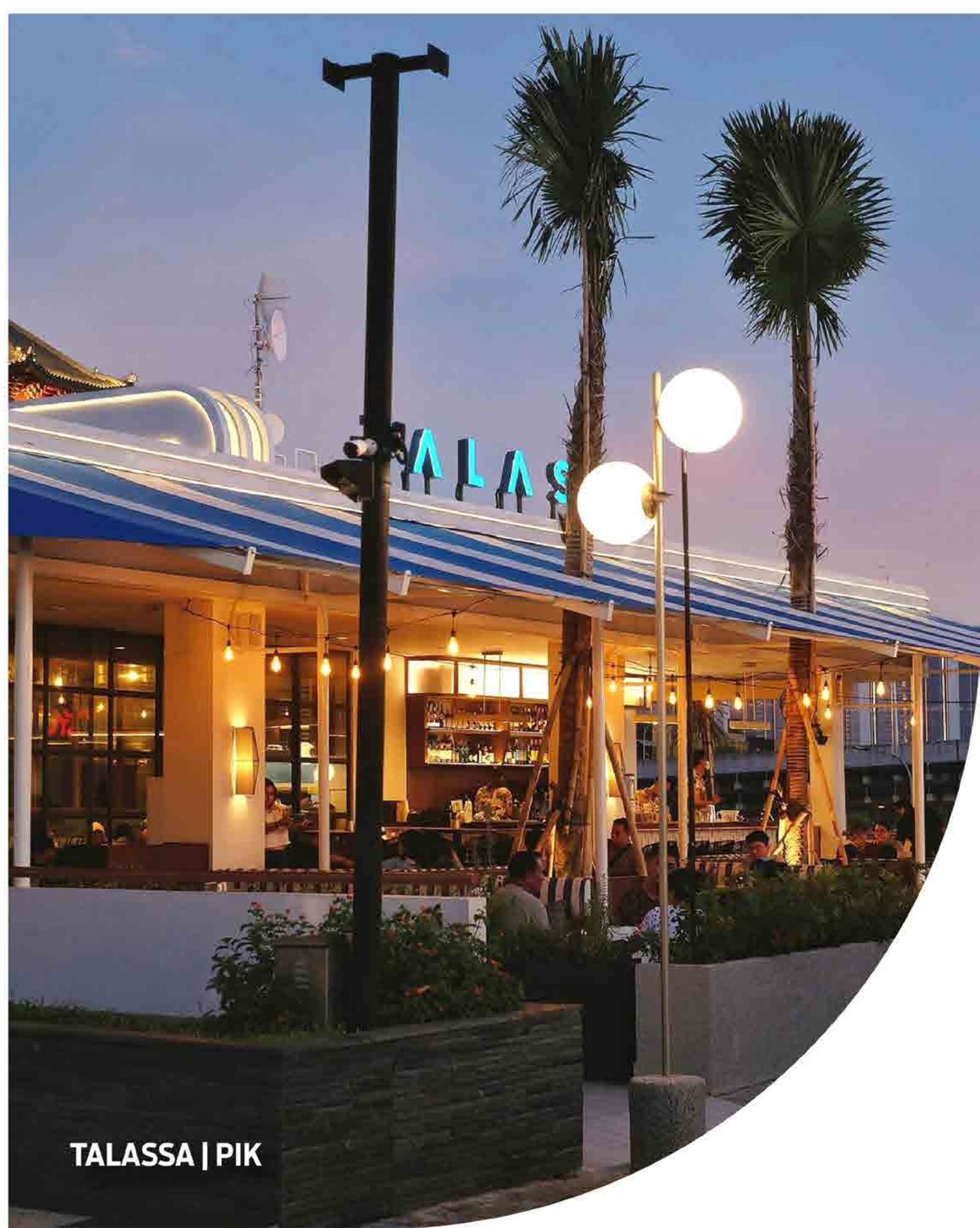
TALASSA | PIK

Time to dive into flavor and style as we show you around Indonesia's freshest spots – Talassa Jakarta and 1959 Cocktail Bar & Dance Club! Think irresistible cocktails, foodies, and a nightlife you won't forget.